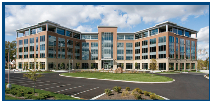
Dave Brown Commercial Photography

In fact, we are in the process of building a new 16 acre park along Deerfield Road, between East Kemper Road and the I-275 overpass in the northern part of the Township. The park will include a lighted Class A baseball diamond, four soccer fields, a walking trail and playground. In the northwest corner of the site we are building a new firehouse to better serve the residents in the north.